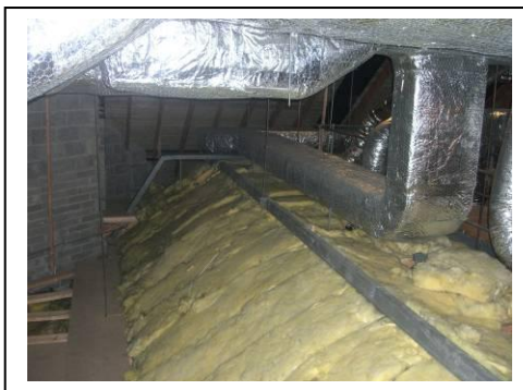
Typical loft insulation and pipe lagging