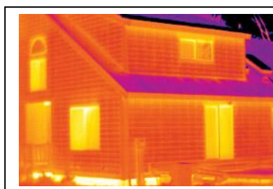
Infra red photo of a building – brightest colours indicate highest heat loss

The use of an infrared thermal imaging camera can also give a visual indication of where heat is being lost from a building. Thermal imaging involves measuring long-wave infrared radiation (heat) and displaying it as a visible picture. Thermal imaging can detect defects in insulation, air leakage, dampness, hidden objects such as flues and air ducts, damaged areas of insulation and blocked heating distribution pipes, locating central heating pipes.