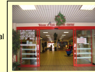
Shopping centre providing amenities in previously unavailable in the area