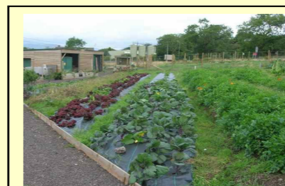
Bute Produce market garden, Argyll Produce goes to local homes and hotels The garden provides local training and employment opportunities