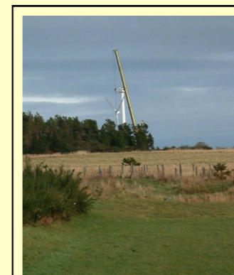
Lifting the blades at Findhorn Wind Park, Ekopia has a 30% stake in this project