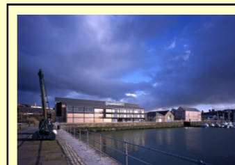
Galeri Creative Enterprise Centre providing a facility for new creative micro-companies