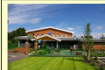
Fenchurch Street Centre—one of the three purpose built Children's centres providing support and training for families