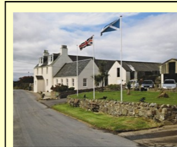
Isle of Gigha Hotel refurbished and now generating profit poured back into the community